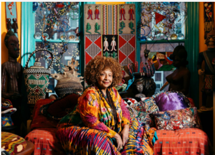
Joyce Scott in her home in Baltimore, pictured in the New York Times , January 4, 2018